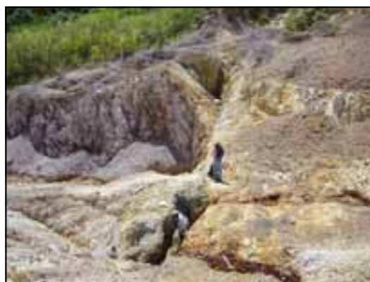
Portion of LSY pit

Priority exploration immediately on grant of the MPSA will include a detailed ground geophysical survey and diamond drilling, focused around LSY.