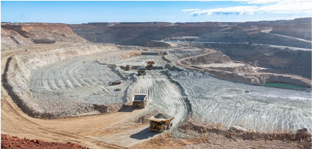
Figure 1: Mining in the southern end of the King of the Hills open pit.