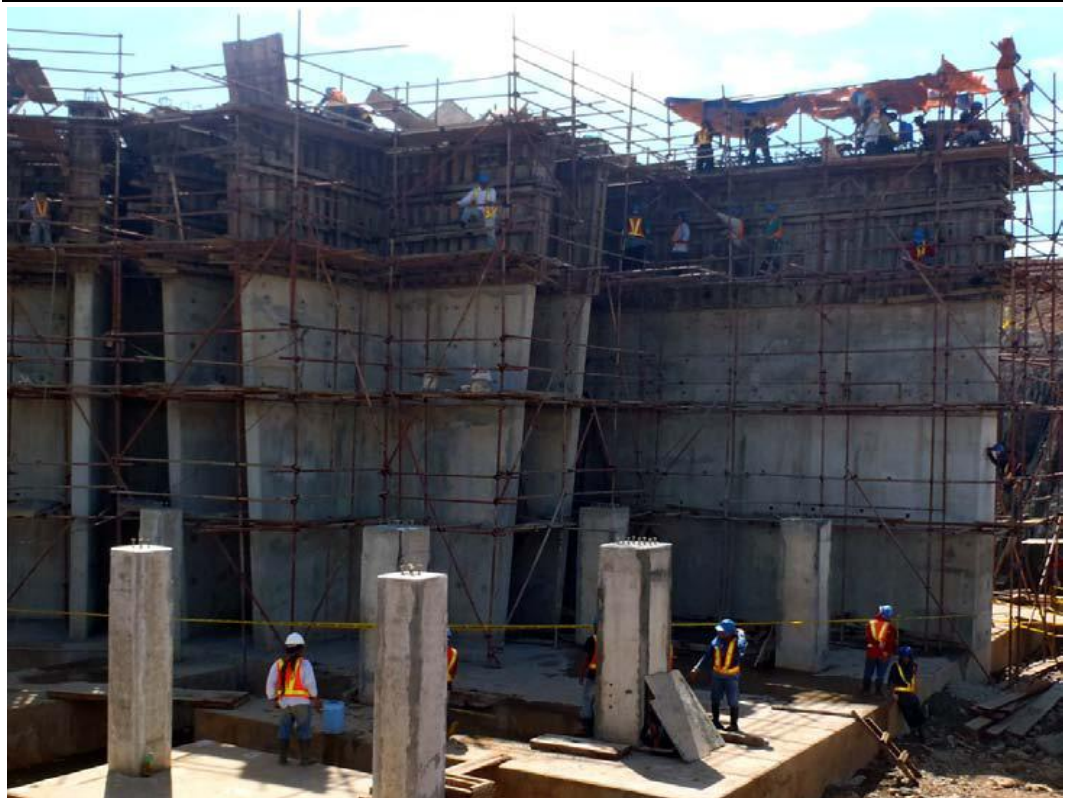
Figure 2: Crusher station foundation and supporting structure