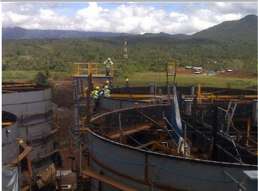
Figure 4: Carbon-in-leach tank train