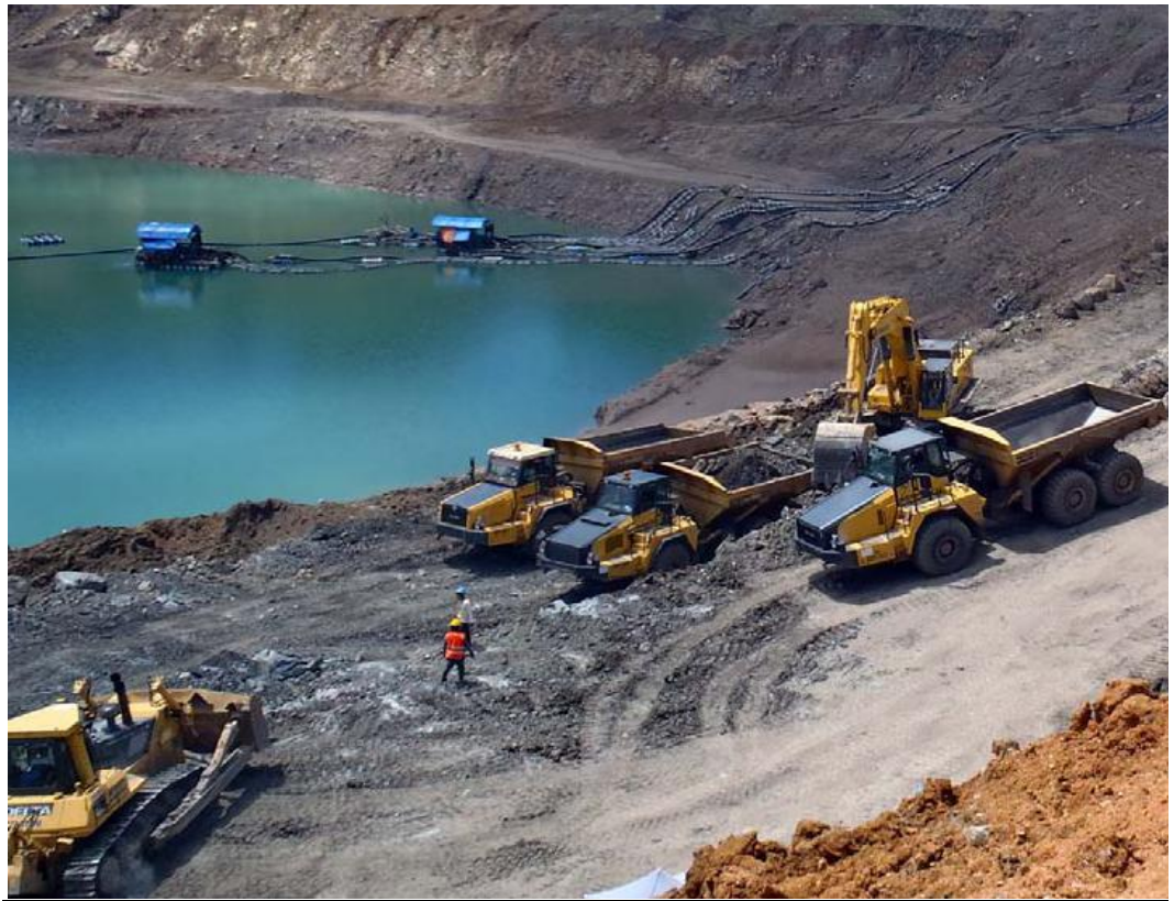
Figure 1: Siana open pit

Open pit cut back activity with pit dewatering in background.