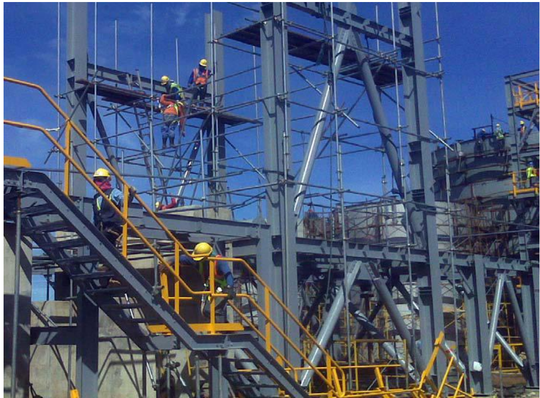
Figure 3: SAG Mill platform and cyclone tower steelwork