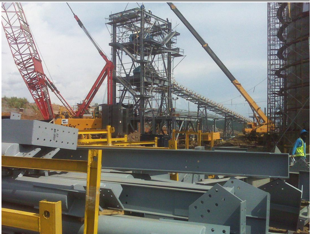
Figure 4: Final steel structure components for cyclone and gravity tower