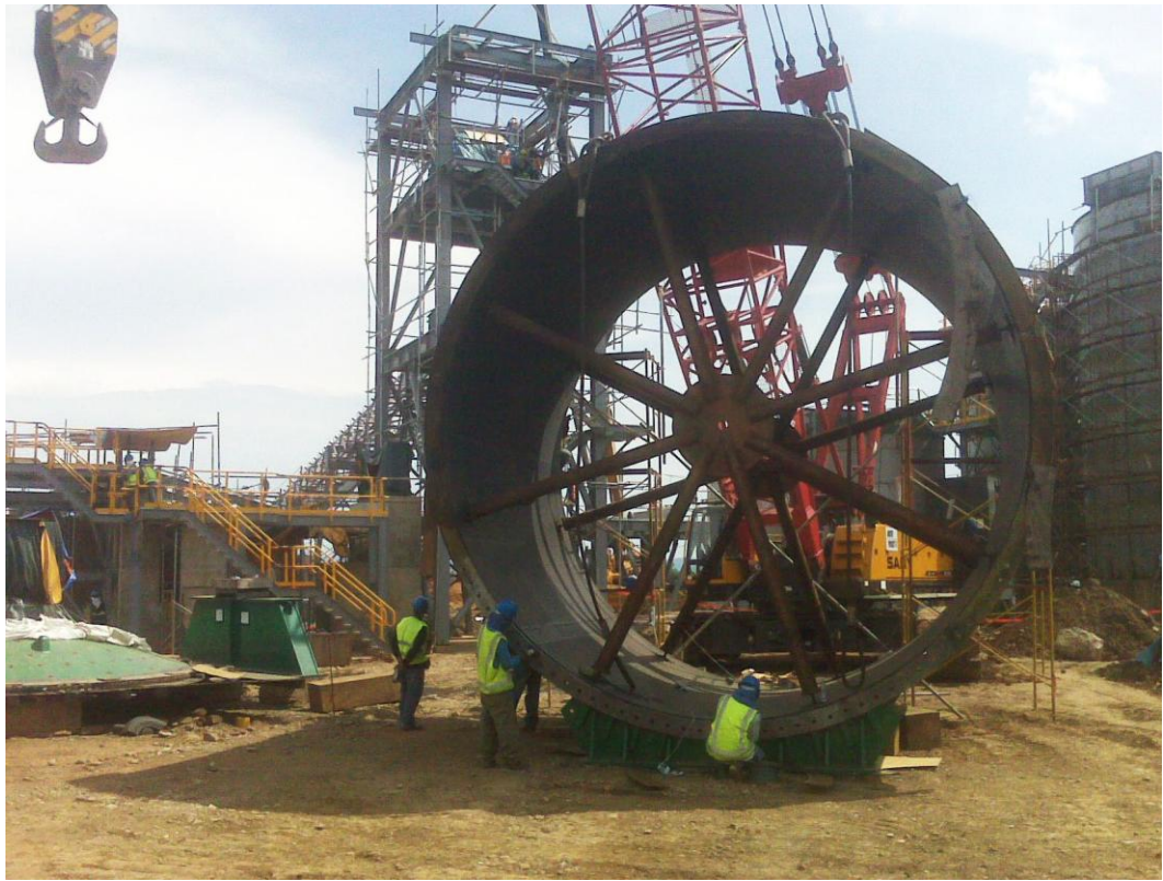
Figure 3: Final preparation prior to SAG mill lift to platform