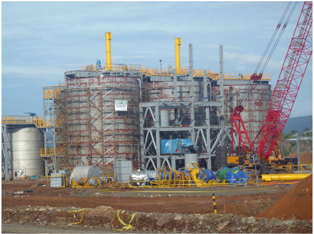
Figure 1: CIL tanks, detox tanks and elution column