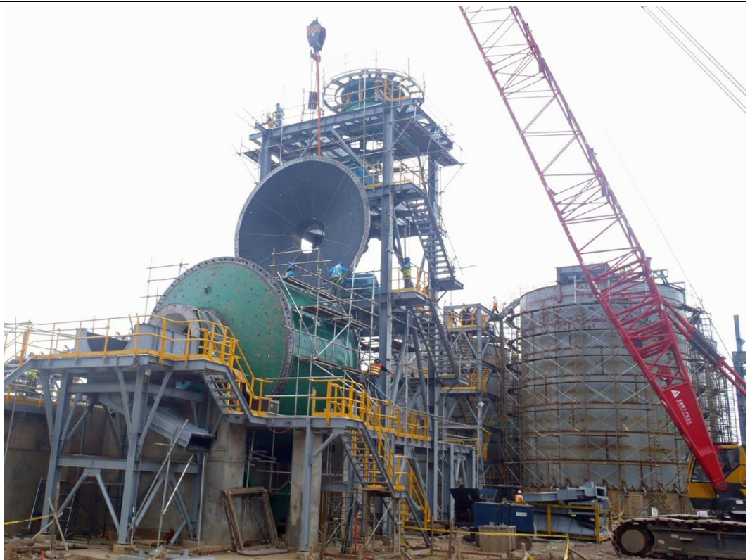
Figure 2: SAG Mill installation